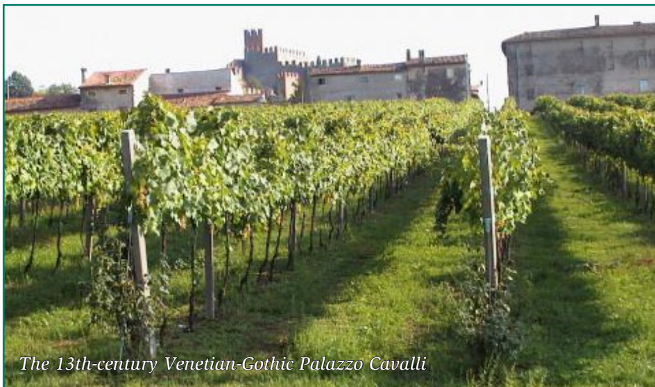
The 13th-century Venetian-Gothic Palazzo Cavalli

and Tramigna, and in the distance the castle of Soave can be seen, along with the Benci mountains and the top of the Euganean Hills.